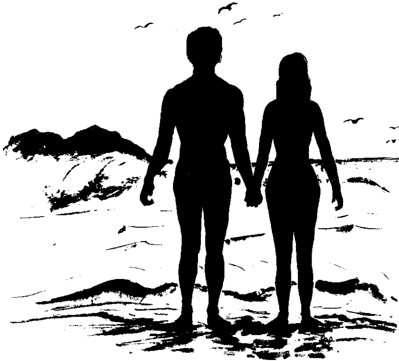
Fig. 12, MALE AND FEMALE FIGURE CONTRASTS

female, the mass difference of shoulders and hips shows that above the waist the male is female polarity and the female is male polarity; so also, in contrast to this, below the waist the male body is of male positive projective polarity and the female is of female negative receptive polarity. (Fig. 12)